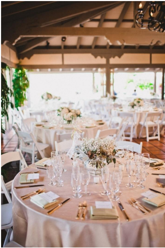
Central Patio Room